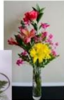
*Selections may vary